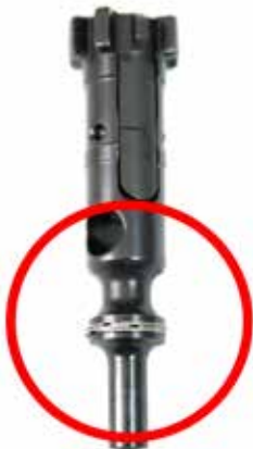
Correctly Staggered Gas Rings