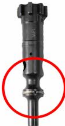
Incorrectly Staggered Gas Rings